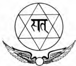
Seal of the Esoteric School.