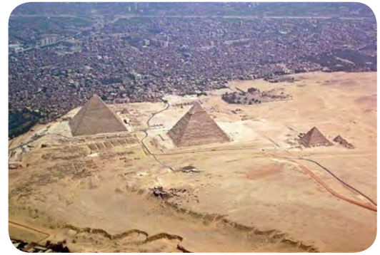
Pyramids of Gizeh, seen from above. The great pyramid was a Mystery School.