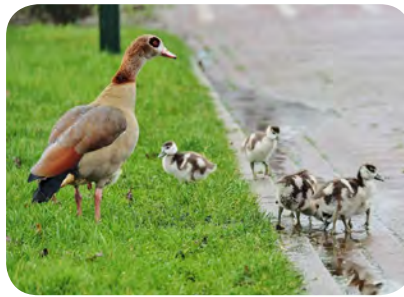
The Egyptian goose prospers well in urban environments. Great Britain, the Netherlands, France and Germany have self-sustaining populations which are mostly derived from escaped birds.

We, the originators of this problem, will sooner or later face the consequences of the disharmony we have produced. After all, every act we perform will evoke a corresponding effect, which we will have to face (karma). In fact, we are reaping the consequences already: worldwide it is becoming increasingly difficult to get good drinking water; in some cities people pay a lot of money for it. Furthermore, the area of fertile agricultural land is decreasing, fish populations become depleted, and so on.